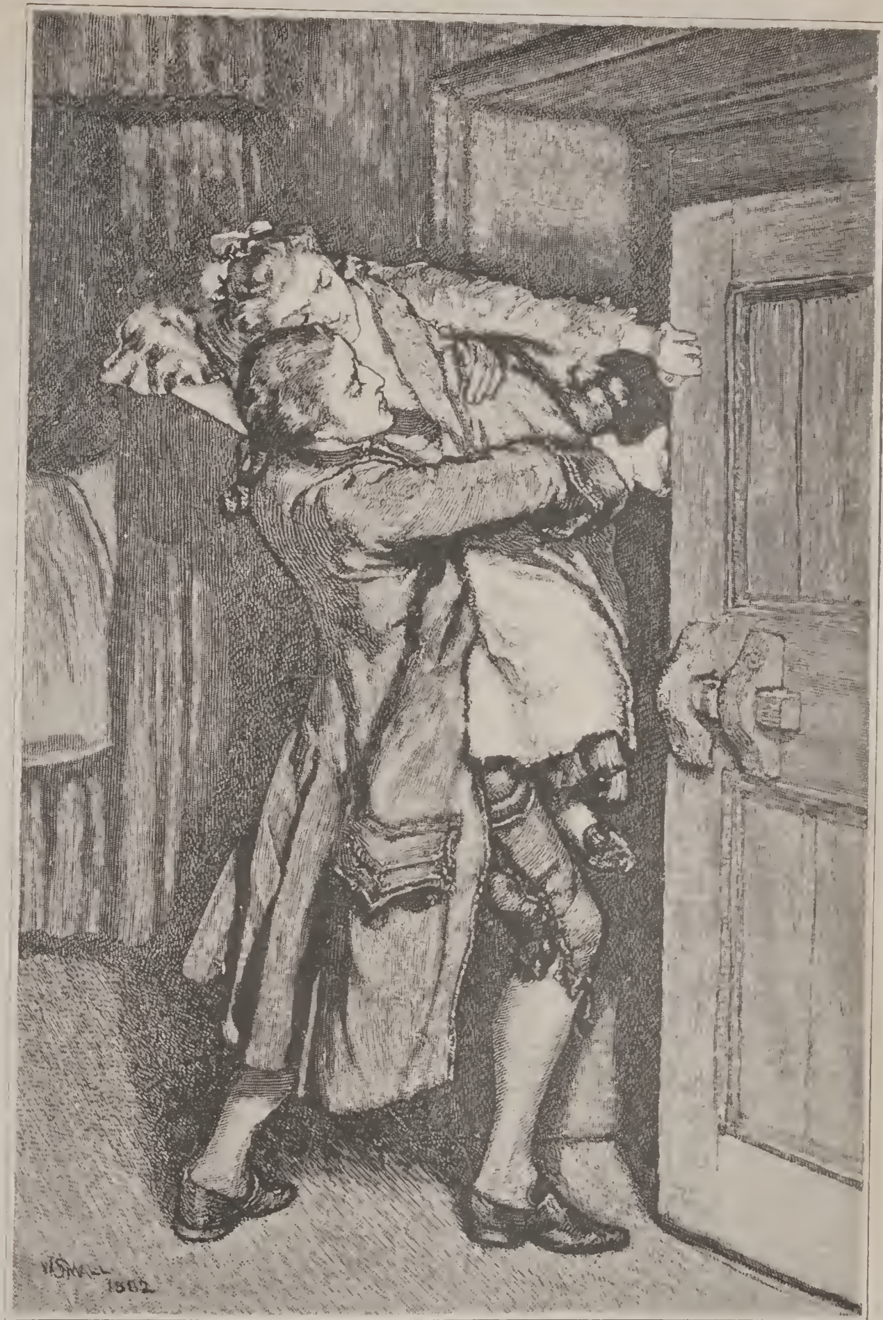
“ Taking her in his arms, he shut her out of the room ”